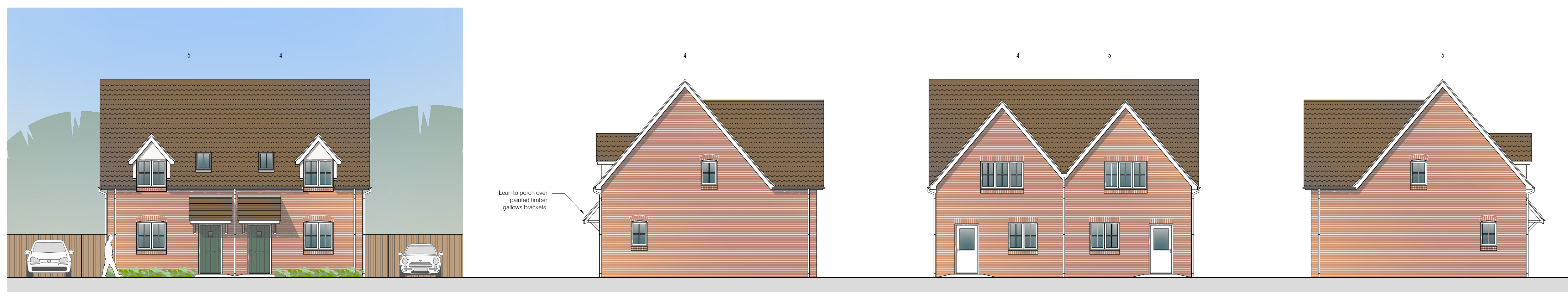
Front Elevation ~ Plots 4-5